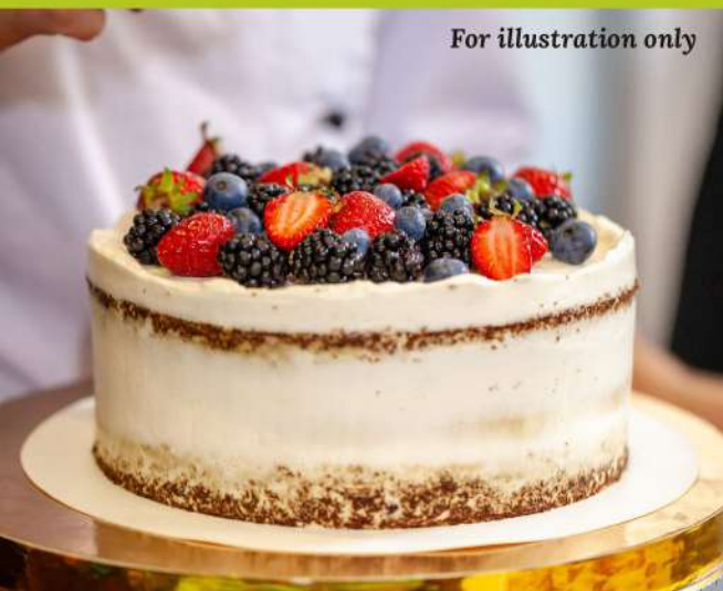
For illustration only