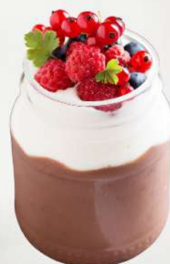
For illustration only